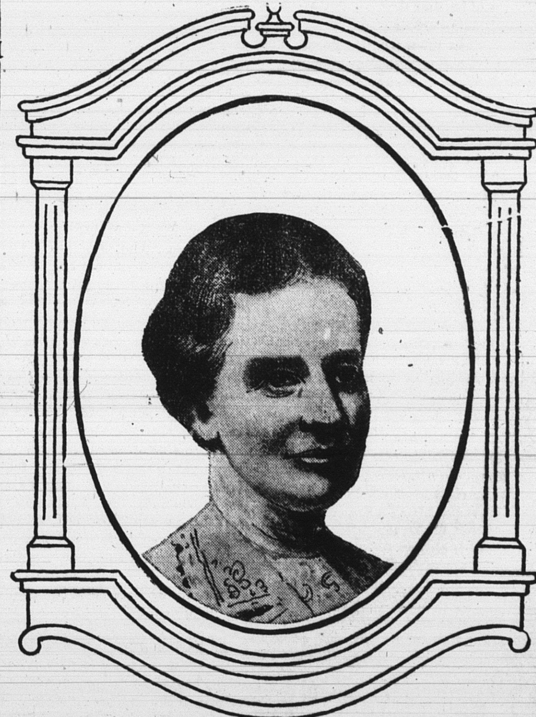
MRS. THEODORE ROOSEVELT.

This would be remarkable in an author whose sole occupation was writing. It appears still more so in a man to whom authorship is but an incident, when we recall that he has served three terms in the New York legislature; that he was for five years a member of the civil service commission, and for three arduous years president of the board of police commissioners in New York city; that he has been assistant secretary of the navy, commander of a regiment in the war with Spain, governor of New York and vice president of the United States. Furthermore, to appreciate fully the size of Mr. Roosevelt's product as an author we must bear in mind two