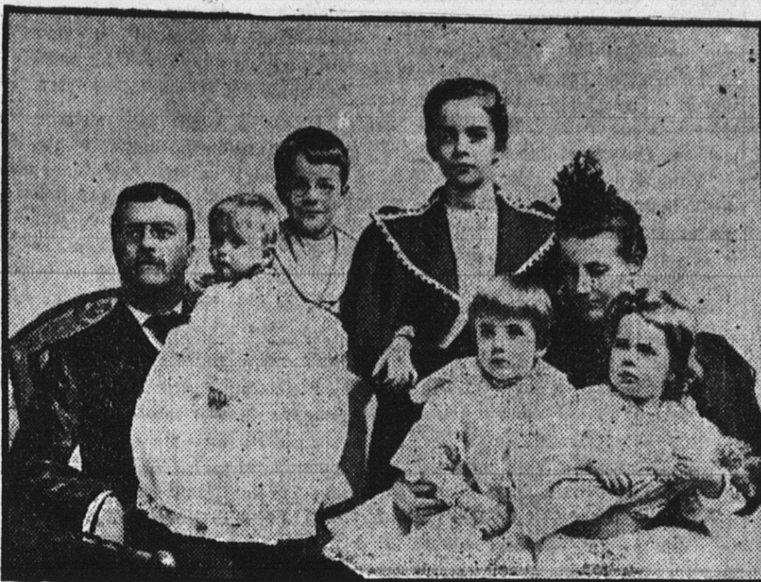
THE ROOSEVELT FAMILY.

Born—New York, October 27, 1858. Educated—Cutler's private school, New York; and Harvard. Graduated from Harvard, 1880. His Favorite Studies There—History, philosophy and government. Elected to State Legislature—1883. Defeated for Mayor of New York—1886. Became Noted as New York Reform Police Commissioner—1895. Served as President Harrison's Appointee on National Civil Service Commission—1889-1895. President McKinley made him assistant secretary of navy, 1897. Organized the rough riders and fought at their head at San Juan. Was elected governor of New York, 1898; plurality over Augustus Van Wyck, 18,000. Was elected vice president, 1900. Took the oath of office as president of the United States September 14, 1900. Married Miss Edith Kermet Carow