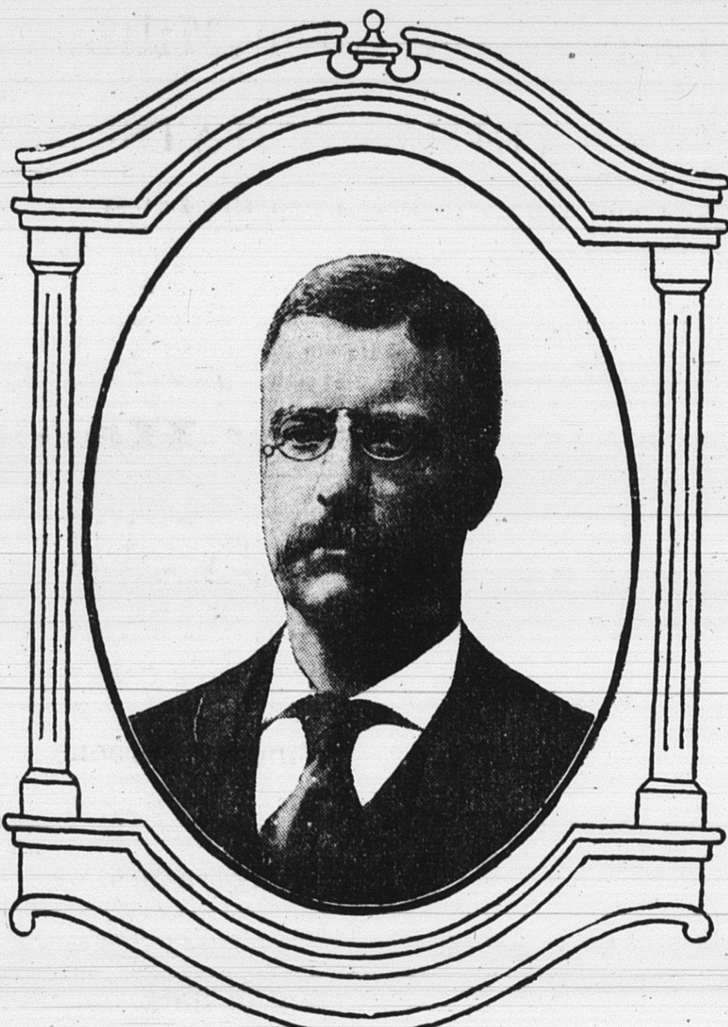
PRESIDENT THEODORE ROOSEVELT.

It is almost certain that the cabinet of President McKinley will be the cabinet of President Roosevelt. He not only requested them to remain, but stated to them that they were his choice for the positions which they were occupying. All of the members, including Secretary Hay, complied unconditionally. In the event of Secretary Hay's retirement (sooner or later) it is altogether probable that Secretary of War Root will succeed to the state portfolio. This will make an opening for at least one new man to take charge of the war office. No other changes under present circumstances are even remotely likely.